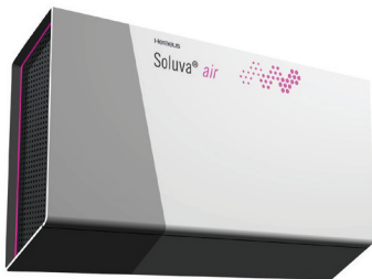
Reliable air disinfection: Soluva® Air W

Safe UV air disinfection without chemicals for highly frequented rooms